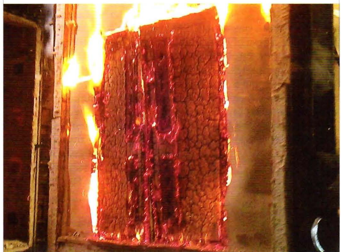
Fire door testing at Exova. The rear of doors after an hour at 1,000°C

Look at the photograph below of the backs of a pair of double-acting one-hour fire doors after more than an hour of exposure at 1,000°C. What is amazing is on the other side the front faces look pretty “normal”. So – does wood need to be treated to make it “fireproof”? You tell me! ■